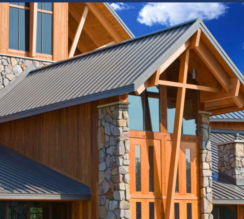
Holy Family Catholic Church, Woodruff, WI